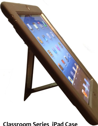
Classroom Series iPad Case