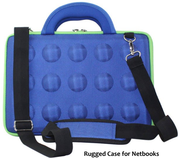
Rugged Case for Netbooks