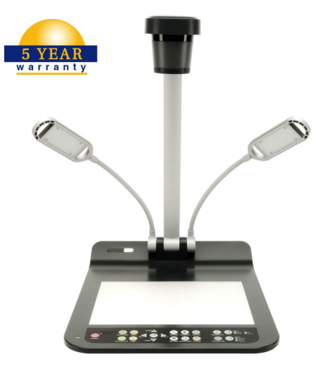
Made in Taiwan

The Dukane 336B provides superior image quality and uses a flexible gooseneck that easily captures views of any object from any angle. Connect directly to a projector or any display device with the included VGA cable or connect to a computer via USB.