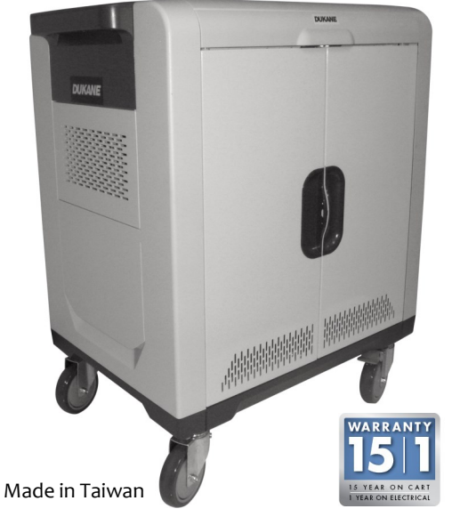
iPad is a trademark of Apple Inc.